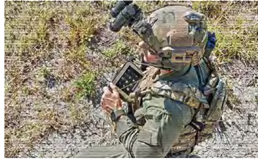
Soldier Borne Communication System

digital images collected for transmitted surveillance information.