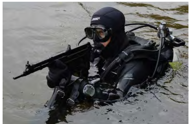
Underwater Scope for Seal Team

The new electronic army of today is ever-present in our military technologies. Much of a nation's defense begins with