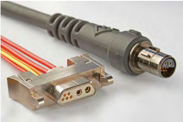
Miniature Power Plus Signal Connector