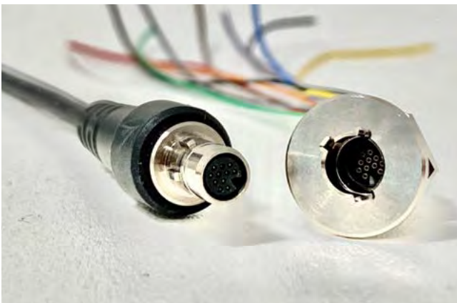
Quick Disconnect Nano Circular

The newer miniaturized cable and contact systems utilize a military quality Nano-sized circular connector for numerous reasons. Beyond rugged and lightweight, the military quality Nano-circular connectors include a keyed contact and alignment system for blind mating with gloves on and breakaway instantly when needed. Fit and function are perfect for gun scopes, on-board sensors and inside UAVs and remotely controlled ballistics. Nano-circular connectors are also designed for water-proof applications within the weapon as well as the warrior's equipment needed for duty in Seal type functions. Nano-sized interconnects of various designs are used in soldier-borne systems to control field based mid-sized portable UAVs. The larger UAVs carry heavier weapon loads and receive the benefit with extended flight time and higher resolution