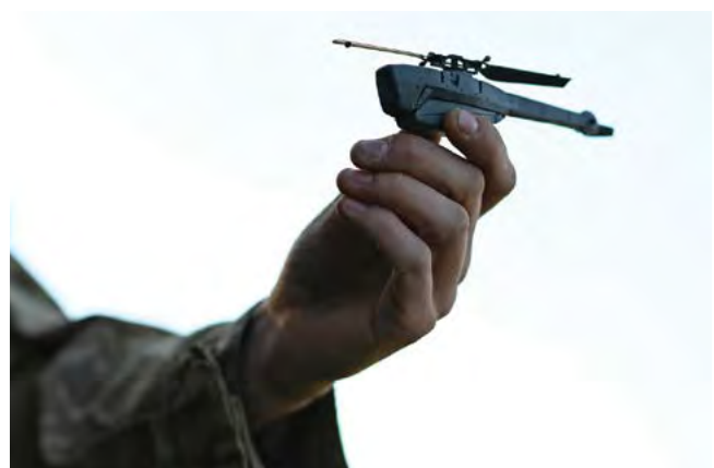
Black Hornet UAV

knowing what is happening and, more importantly, what is about to happen before it does. Constant surveillance and mapping has been improved by use of multispectral and LIDAR, (light detection and ranging), imaging techniques. Previous generation laser and optical surveillance devices are limited in what they can see. Lidar systems penetrate masking and camouflage devices as well as forest and jungle shielding. New phased array radar and photon emission